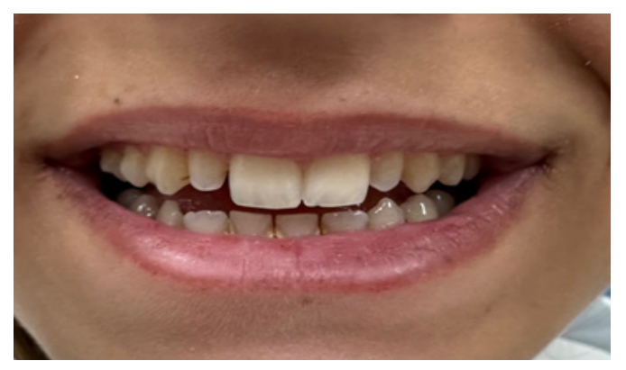
Figure 1. Appearance of wedge-shaped lateral incisors while smiling before treatment

A 20-year-old patient with bilateral wedge-shaped lateral incisors presented to our clinic with aesthetic expectations. After intraoral and radiological examinations, treatment options were explained to the patient, and based on the patient's preference, it was decided to apply direct composite veneers. After determining the tooth color, an appropriate composite resin (A2, OA2 Tokuyoma Estelite \Sigma Quick [Tokyo, Japonya]) was selected (Figure 1 and Figure 2).