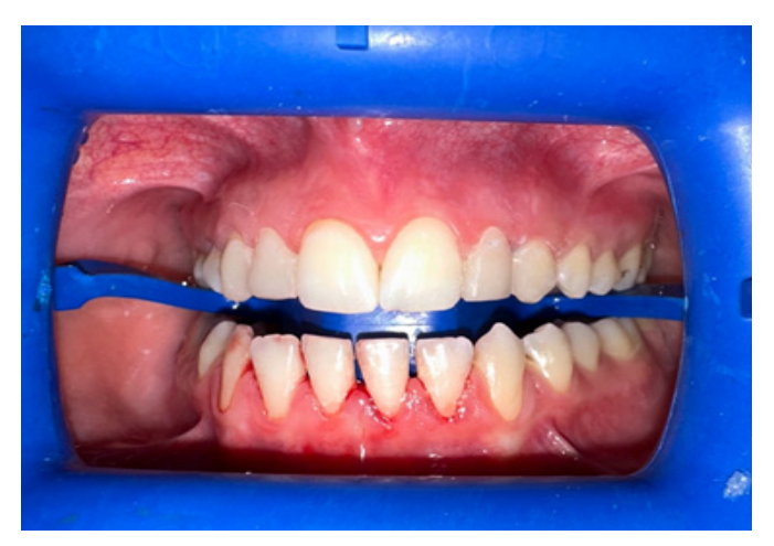
Figure 3 . Due to the patient being away from the city for an extended period, our opportunity to take photos of the lateral teeth was limited during this session. Additionally, the presence of bleeding in the lower anterior region occurred as a result of the necessary removal of tartar during this session

Before starting the treatment, a polishing procedure was performed. Total acid etching (Dentsply conditioner 36 acid jel 30 seconds) was carried out without tooth preparation. Following the acid etching, bonding (tokuyoma bonding force 11) application was applied, and 10 seconds for polymerization Led E plus polymerization filling device applied. The teeth were shaped with composite resin (A2, OA2 Tokuyoma Estelite Σ Quick [Tokyo, Japonya], 40 seconds for polymerization Led E plus polymerization filling device) to achieve a natural form, completing the treatment in a single session. After the application of composite resin was completed, the surfaces of the restorations were refined using special finishing burs and polishing disks. At the end of the treatment, the importance of oral hygiene and the rules to be followed regarding the restorations were explained to the patient (Figure 3).