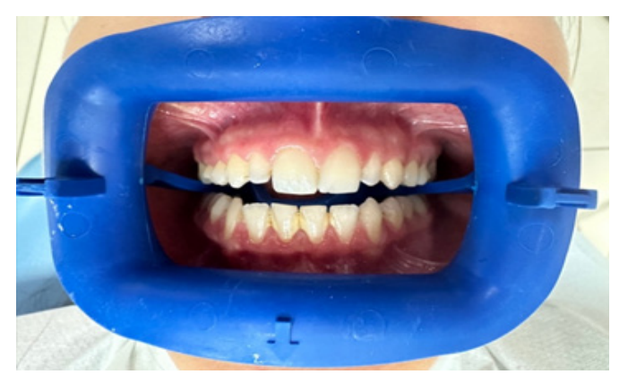
Figure 2. Wedge-shaped lateral incisors of the patient before treatment