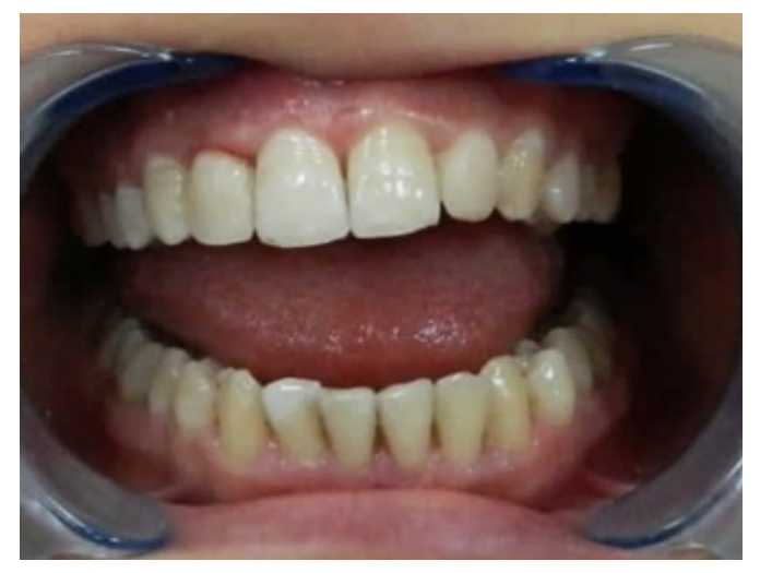
Figure 5. The patient's lateral teeth after the treatment

The total acid etching procedure was performed without tooth preparation. Following the bonding application, the teeth were shaped with composite resin (OA2 Tokuyoma Estelite \Sigma Quick8 [Tokyo, Japonya]) to achieve a natural form, completing the treatment in a single session. Immediately afterward, the surfaces of the restorations were refined using special finishing burs and polishing disks. At the end of the treatment, the patient was instructed on the importance of oral hygiene and the rules to be followed regarding the restorations (Figure 5).